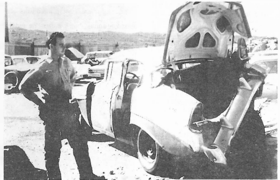
Classified ads will sell anything.

"Good heavens, no! She's far too busy looking for a husband."